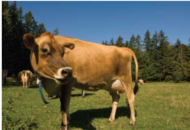
Enjoy bucolic farm scenes on Salt Spring—and then feast on the goods at the famous Saturday market

Sometimes when faced with a tough choice, you have to ask, "What would Pearl Jam do?" In the case of seeing the Gulf Islands, the Seattle band once chartered the luxe Pacific Yellowfin (via the newly launched Exposure) for a high-end movable feast through the area. For the rest of us still waiting for our big break, the circa 1943 classic wooden coastal freighter offers three-day culinary tours (from $2,390) around the Gulf Islands, which include a stop at Salt Spring's farmers market interspersed with seafood pulled straight